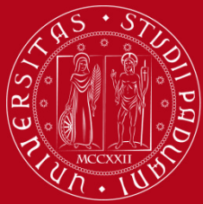
Allegato 2 per il corso di laurea in BIOLOGY OF HUMAN AND ENVIRONMENTAL HEALTH (SC2643, ordinamento 2022) DM270 Classe L-13